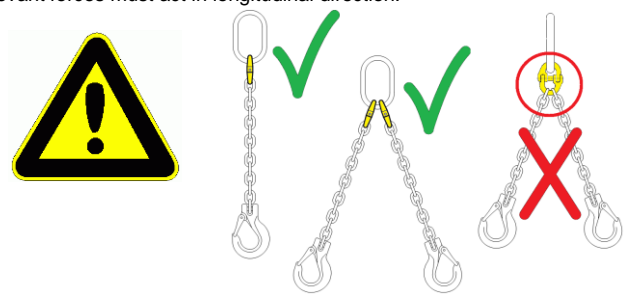
If two chain legs are arranged in one connecting link half for alternate use, only one chain leg must be subjected to loads!

When attaching components observe correct position of the connecting link. Relevant forces must act in longitudinal direction.