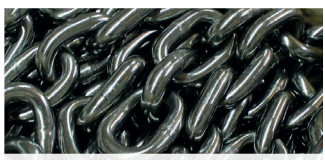
A special heat treatment makes THIELE recycling solutions particularly high wear resistant.

THIELE recycling systems achieve an economical disposal process.